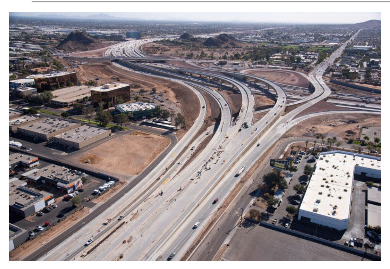
Several new direct connections are now open between I-10 and SR 143.