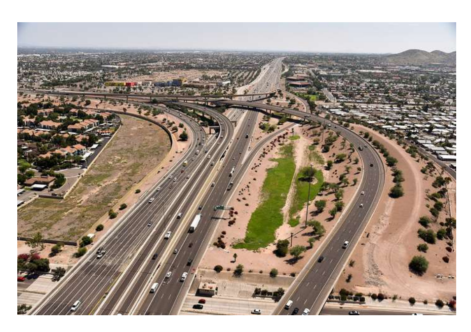
The US 60 and I-10 interchange in 2021.