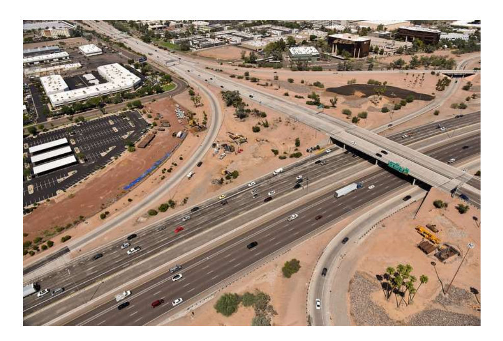
The SR 143 and I-10 interchange in 2021.