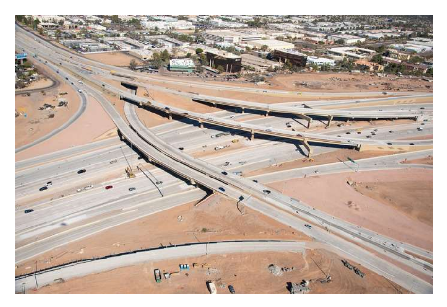
The SR 143 and I-10 interchange in 2024.

In 2025, crews will open the new high-occupancy vehicle (HOV) direct connect ramps between I-10 and SR 143, open the eastbound I-10 off-ramp at 48th Street, and increase the number of lanes on I-10, SR 143, US 60, and several ramps located throughout the project area. Crews will also open up the two new multiuse bridges at Alameda Drive and the Western Canal as well as the Sun Circle Trail Crossing at Guadalupe Road. Finally, crews will wrap up the project to complete pavement work, signage and landscaping.