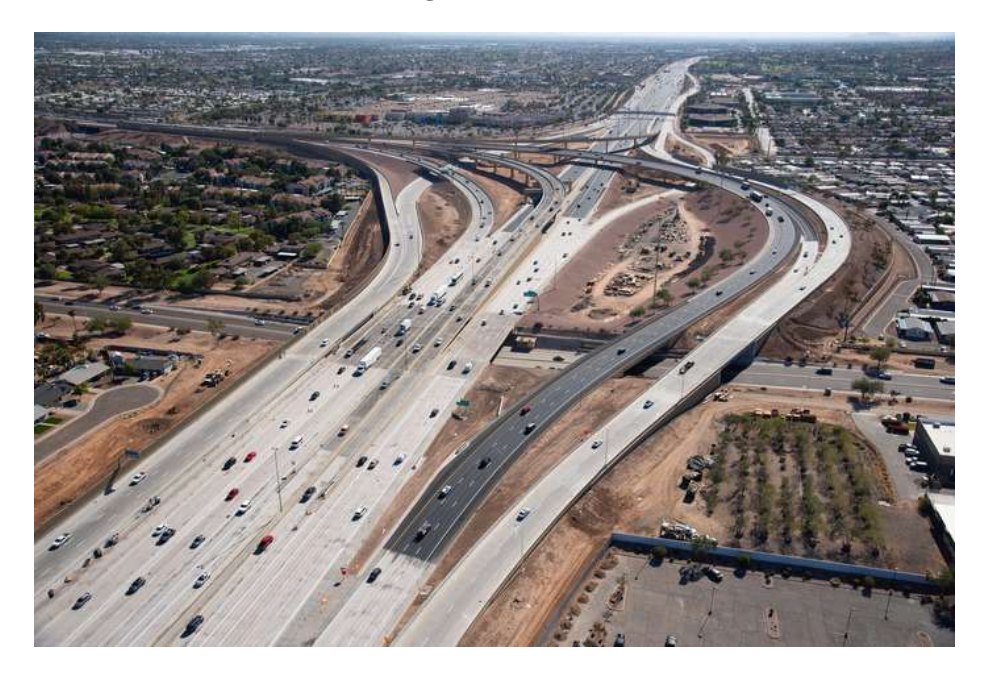
The US 60 and I-10 interchange in 2024.