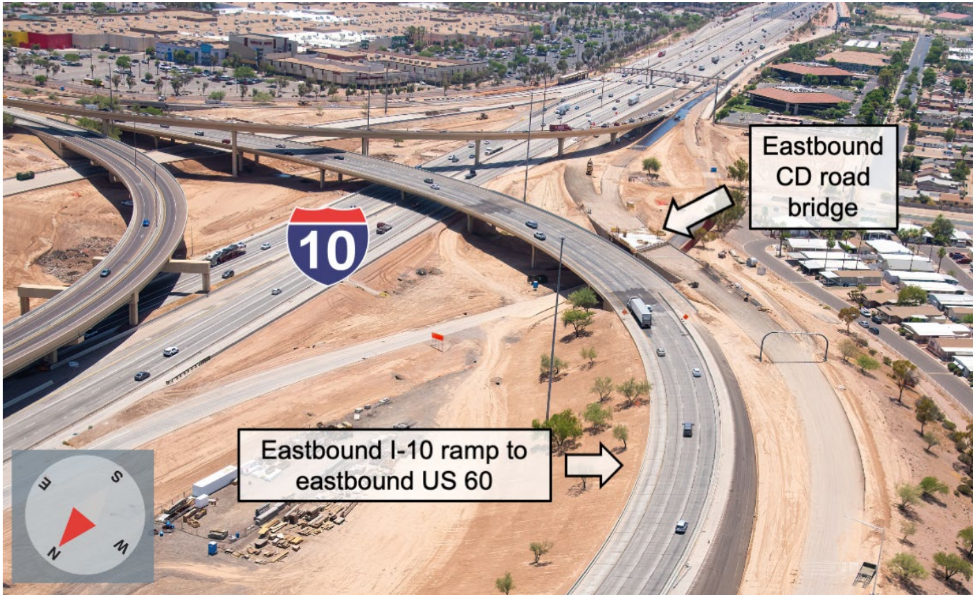
The bridge over the eastbound I-10 off-ramp at Baseline Road, shown here, is part of the eastbound CD road.