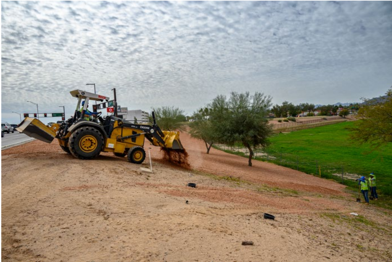
Landscaping work has begun at the eastbound I-10 off ramp at Elliot Road. A loader delivers rock to the west side of the ramp where two workers then spread the rock.