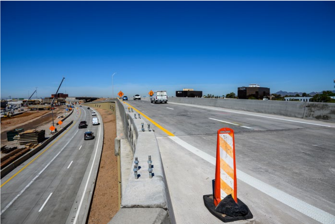
The new westbound I-10 on-ramp at Broadway Road opened in early March.

The new westbound I-10 on-ramp at Broadway Road runs between the CD road and mainline I-10.