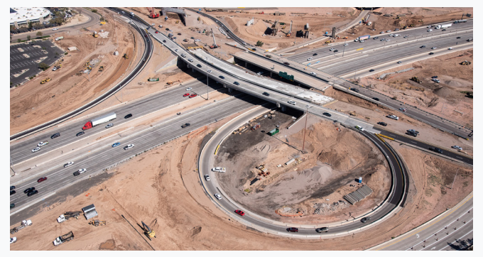
The I-10 interchange with SR 143/48th Street in February 2023 as construction of the 48th Street bridges over I-10 neared completion.