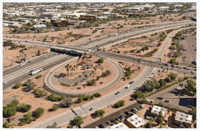
The I-10 interchange with SR 143/48th Street in October 2021 before the construction of the 48th Street bridges over I-10 began.