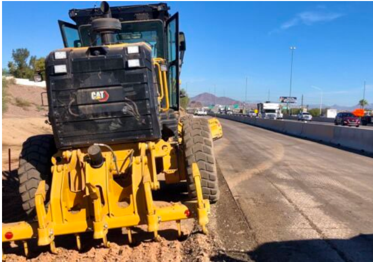
Left: Crews are grading along the shoulder of I-10 in the project's East Segment in preparation for widening. See photos of the latest work here.

removal – will continue during this time. Expect construction activity to increase after the start of 2022.